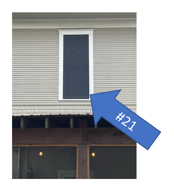
Eastside 2<sup>nd</sup> floor House 1 window